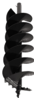
Auger Bit - Double Impeller - 250mm

Model: KMD25008 Length: 1000mm, Diameter: 250mm