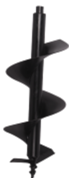
Auger Bit - Single Impeller - 300mm

Model: KMD30001 Length: 800mm, Diameter: 300mm